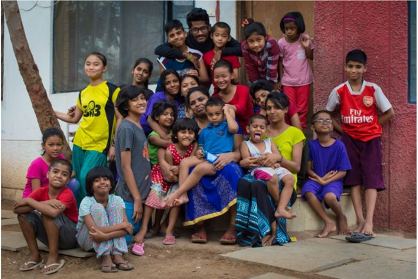
Village of Hope - Pune, India

Our heart is to give real hope and a future to those victimized by the evil of sex trafficking.