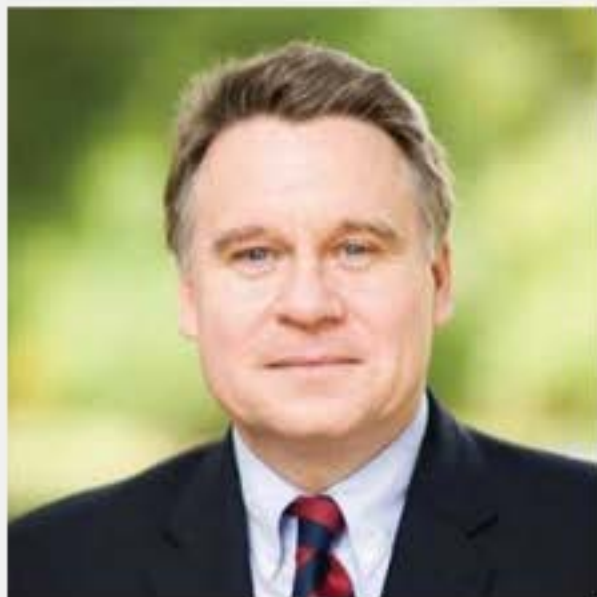
Congressman Chris Smith U.S. Representative from New Jersey, Lifetime Pathbreaker Award